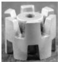
Shape with 180% height difference

*Includes cases in which some machining is necessary due to shapes such as side holes, undercut, etc.